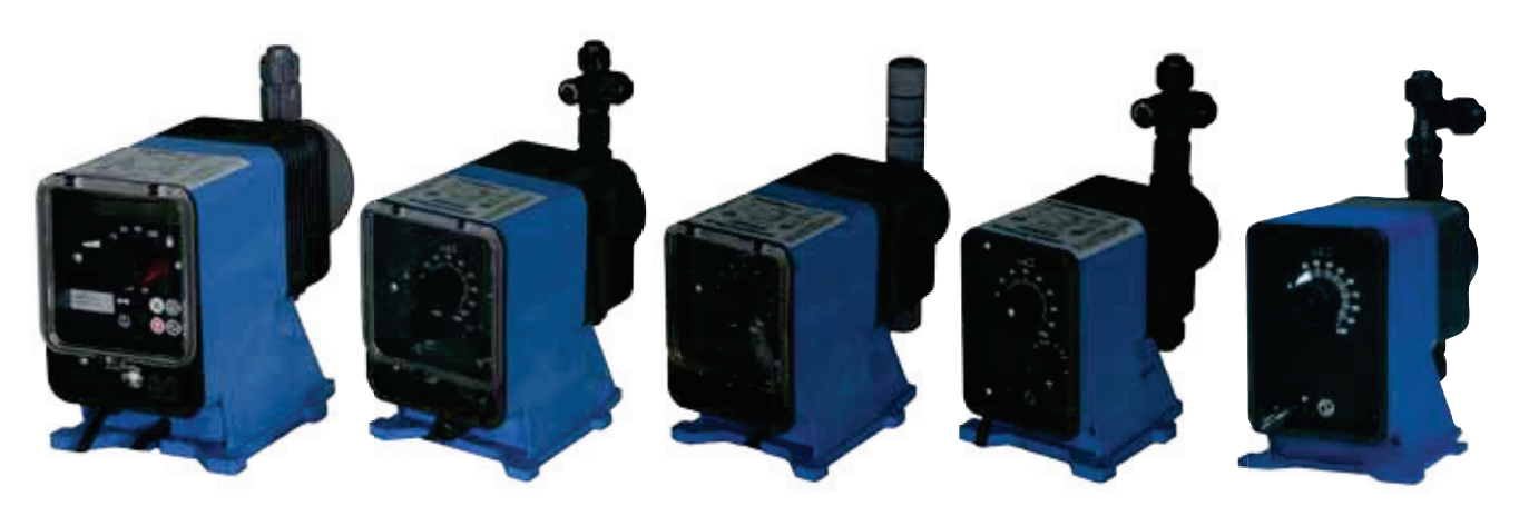
The Pulsatron is available in several different series. Shown here are the Pulsatron MP Series, E Plus Series, HV Series, A Plus, and C Series.