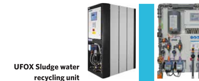
UFOX Sludge water recycling unit