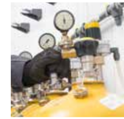
V10k™ Vacuum gas feeder