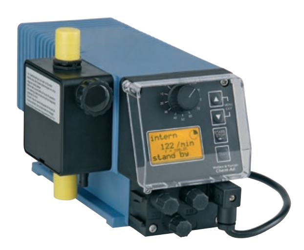
Chem-Ad® Series B