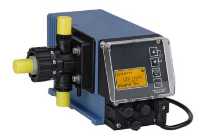
Chem-Ad® Series A