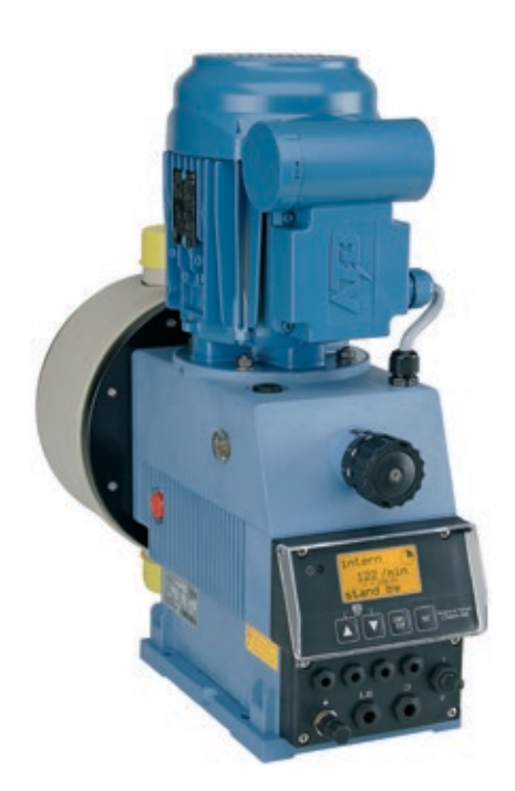
Chem-Ad® Series C