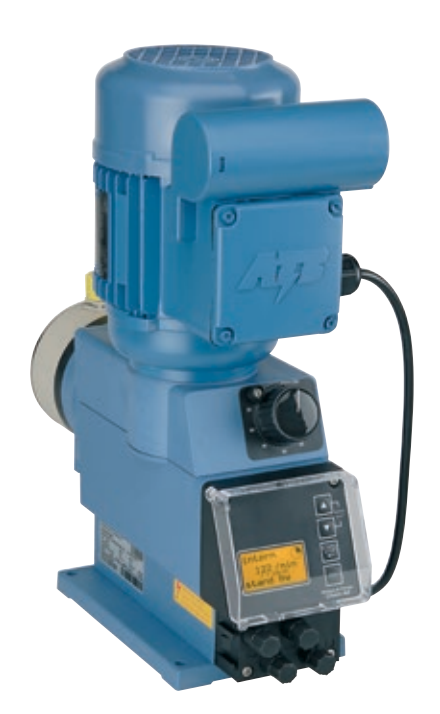
Chem-Ad® Series D