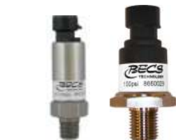
Pressure and Vacuum

BECSys controls are distributed by knowledgeable, factory-trained professionals who will not only assure that your system is running smoothly, but also complies with local, state and federal regulations.